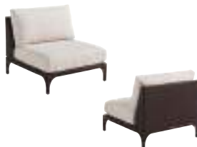
3420-51A/CS3420-51A Abaco Armless Chair and Cushion Set 34.5W x 37.5D x 34H in.