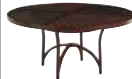
3420-870CT Abaco Round Dining Table Top 60 diameter x 2H in.