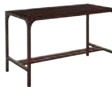
3420-873 Abaco High/Low Bistro Table 62W x 30D x 42-36H in.