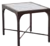
3420-955 Abaco End Table 28W x 22D x 22H in.