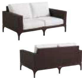
3420-22/CS3420-22 Abaco Love Seat and Cushion Set 62W x 37.5D x 34H in.