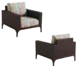
3420-11/CS3420-11 Abaco Lounge Chair and Cushion Set 34.5W x 37.5D x 33H in.