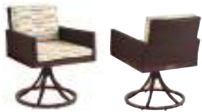
3420-13SR/CS3420-13SR Abaco Swivel Rocker Dining Chair and Cushion Set 23.5W x 28.5D x 34H in.