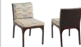
3420-12/CS3420-12 Abaco Dining Side Chair and Cushion Set 19.5W x 28.5D x 34H in.