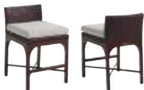
3420-17/CS3420-17 Abaco Counter Stool and Cushion 20.5W x 23D x 31.5H in.