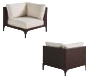
3420-51CR/CS3420-51CR Abaco Corner Chair and Cushion Set 37.5W x 37.5D x 34H in.