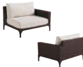
3420-51R/CS3420-51R Abaco Right Arm Facing Chair and Cushion Set 44.5W x 37.5D x 34H in.