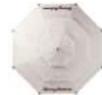
3100-610 Tommy Bahama Signature Umbrella 11 ft. diameter x 8 ft. 9 in. H