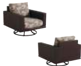
3420-11SW/CS3420-11SW Abaco Swivel Lounge Chair and Cushion Set 34.5W x 37.5D x 33H in.