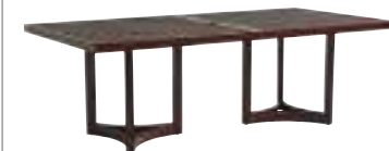
3420-876CT Abaco Rectangular Dining Table Top 88W x 44D x 2H in.