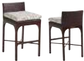
3420-16/CS3420-16 Abaco Bar Stool and Cushion 20.5W x 23D x 37.5H in.