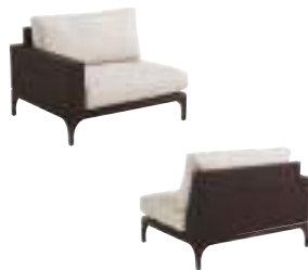
3420-51L/CS3420-51L Abaco Left Arm Facing Chair and Cushion Set 44.5W x 37.5D x 34H in.