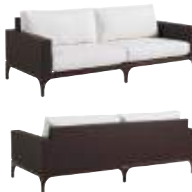
3420-33/CS3420-33 Abaco Sofa and Cushion Set 88W x 37.5D x 34H in.