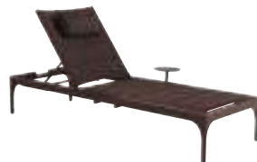
3420-75 Abaco Chaise Lounge 28W x 78D x 40H in.