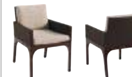
3420-13/CS3420-13 Abaco Dining Arm Chair and Cushion Set 23.5W x 28.5D x 34H in.